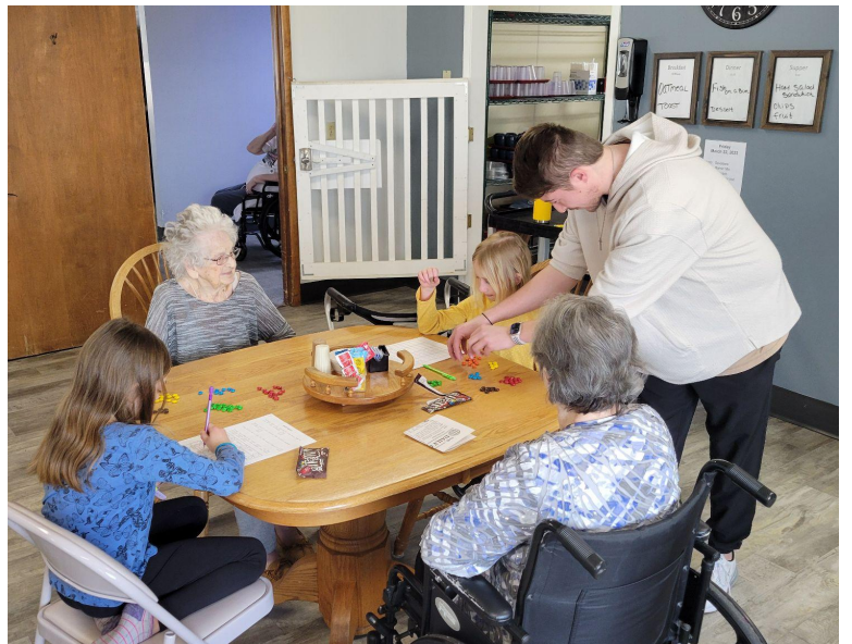
We love our 2nd grade visitors! Last month we had fun solving math problems using M&M candies. It's a creative and yummy way to learn!