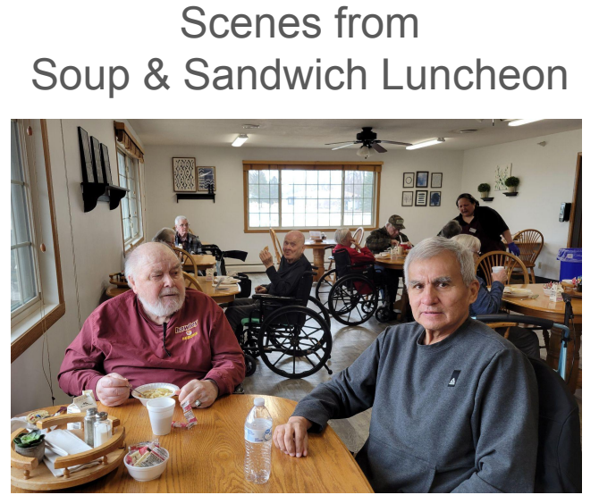
Scenes from Soup & Sandwich Luncheon